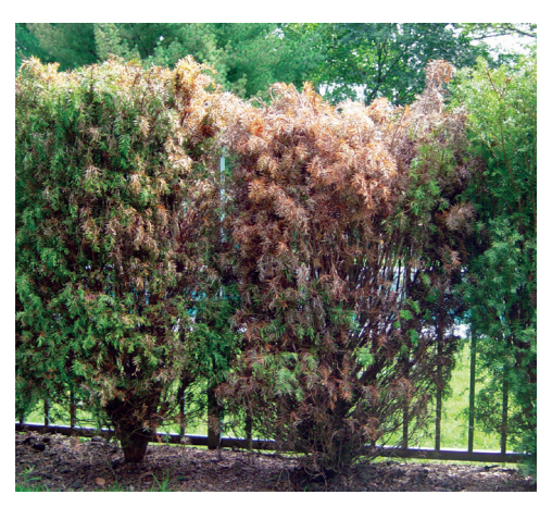
Root zone excavation can accurately reveal the cause of declining plant health in an otherwise healthy row of trees or shrubs

Problems with roots and soil often lead to plant failure. This powerful hand held device safely exposes root systems, allowing for more effective treatments and diagnoses than were available in the past. These tools are also important for developing more precise long term care plans.